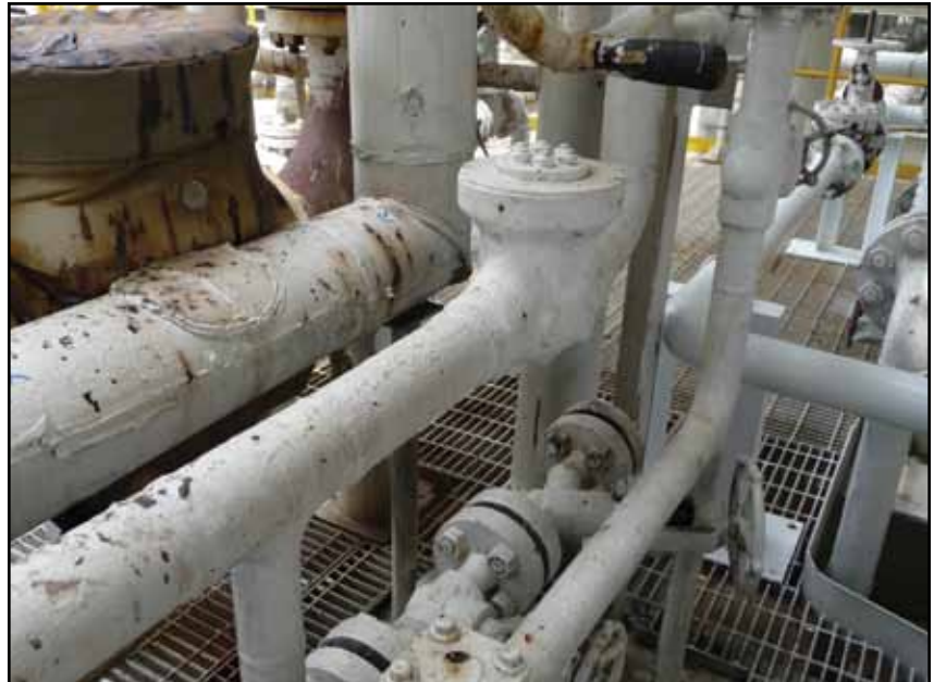
Slamming check valve (center of the photo) due to pulsation.

The troubleshooting team took numerous vibration and pulsation measurements around the pump and at the piping check valve. The pulsation levels greatly exceeded pulsation guidelines from API 674 at the check valve and the pumps were confirmed to be the source of the vibration and noise. This was discovered by com-