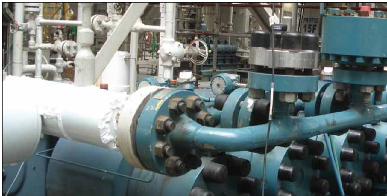
Shown here is the Quadruplex double-diaphragm pump.

the suction and discharge systems, which predicted high shaking forces in the piping at a number of locations. This model assumed a fully functioning set of four fluid ends.